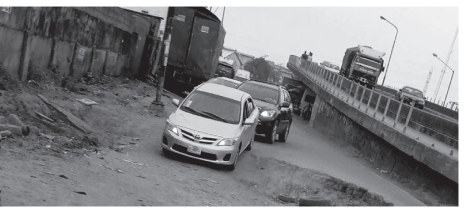
The bad section on Iyana Isolo Road

He added that the dilapidated road caused significant mechanical damages to their tricycles on several occasions. He said: "We humbly appeal to the government to help us repair this road before it gets worse than this. We spend so much repairing our tricycles or the other on weekly basis. When rain falls, this place During busy hours, this portion becomes almost impassable. We hope something can be been a major concern for the done as a matter of urgency.