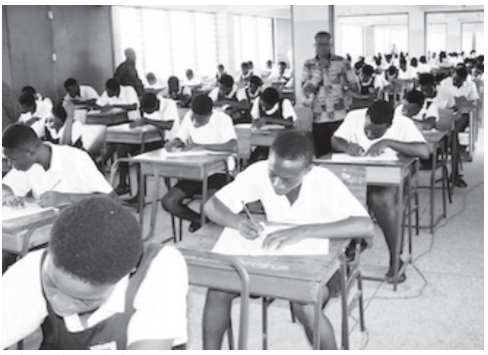
Students writing examination

For instance, in 2019, a total of 1,020,519 candidates in Nigeria representing 64.18 percent obtained credits and above in minimum of five (5) subjects including English